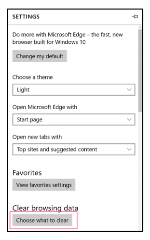
Figure 2 select Clear Browsing Data

3. On the settings window then select Clear Browsing Data